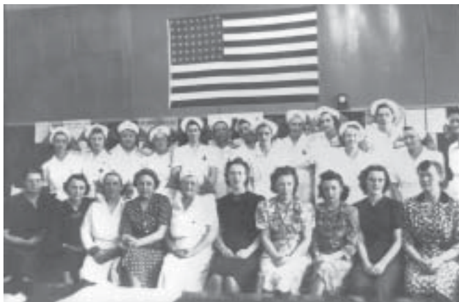
We're not quite sure if this is the American Red Cross group during WWII or the American Cancer Society bandage rollers of the post war era. What we do know is that all of the ladies pitched in and helped!

I still haven't figured out how this works when our center is listed as a warming center in the winter months and a cooling center in the summer months. Today, we may have more children in Marktown than in relatively any other period in this communities history. When we have the Breakfast with Santa program more than 150 children from Marktown participate. While they are not always at the center, one of