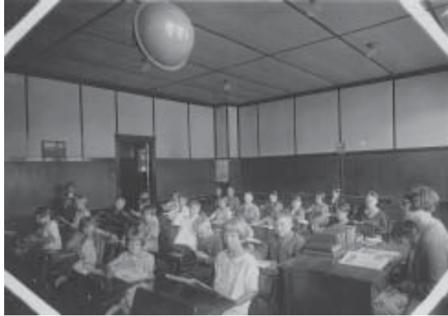
The Old Marktown Community Center in 1923 when it was still being used as an elementary school.

At one time we also had a Men's Club and a separate Women's Club. The Women's Club of today is in a way fashioned after the prior organized groups that served our community. I suppose that the only difference is that in the past, virtually all of the organizations in this neighborhood attempted to stay out of neighborhood politics all together. Their only purpose was to serve the community and not