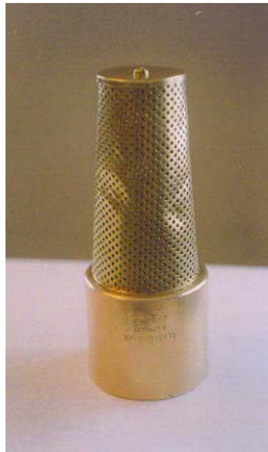
An early 1900's brass water strainer manufactured by Clayton Mark & Co. part number 2-5340. It too is now a part of the Marktown Preservation Society collection.