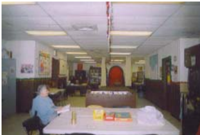
The Old Marktown Community Center in 2004. What a difference eighty plus years makes! Nearly everything shown was donated by Marktown residents and friends!

Life begins when you begin to serve. Serve your neighborhood. Serve Marktown. Volunteer to help make Marktown a Better, Cleaner and Safer Place to Live and Raise a Family.