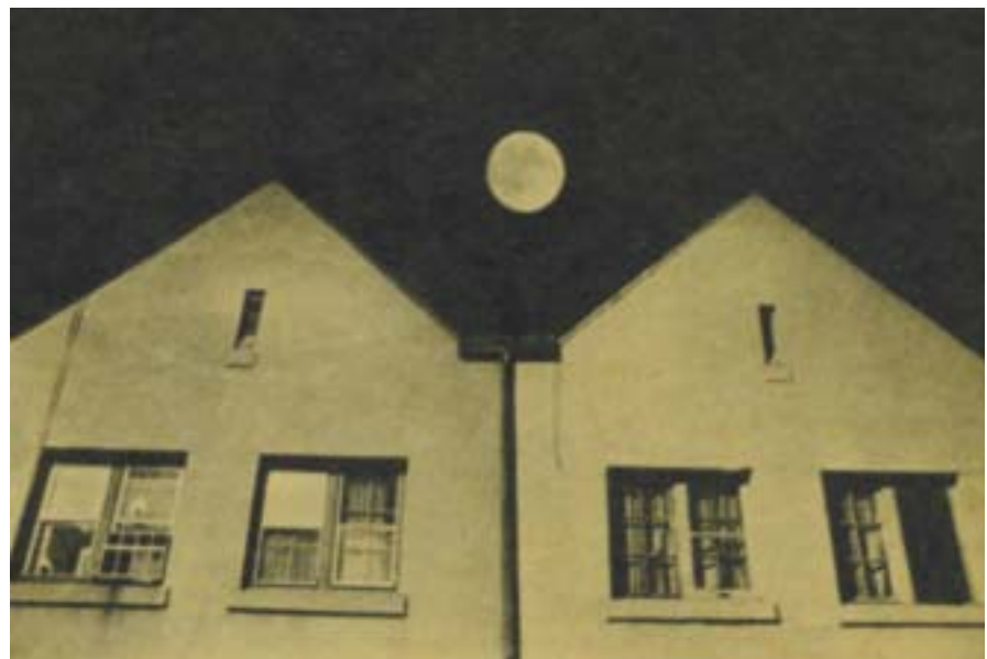
Moon over a Marktown townhouses.

EDITOR'S NOTE: This article is being reprinted as a reminder of what has transpired. While some of the conditions still remain, many of the problems detailed in the article have been resolved over the past 25 years. Solutions to all of the problems that face our neighborhood are available to all of us. First, we must learn to ALL work together. Secondly, we must define exactly what the problems are, and finally, we must work together to not only find the proper solutions, but to solve the problems once and for all!