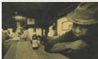
Top: Part of its charm used to be the narrow streets and European-styled homes. Center: "Angel Dust" obscures Marktown. Left: A Friday night at the local tavern.