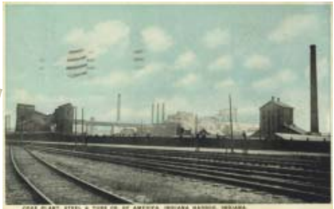
COAL PLANT, STEEL & TUBE CO. OF AMERICA, INDIANA HARBOR, INDIANA.