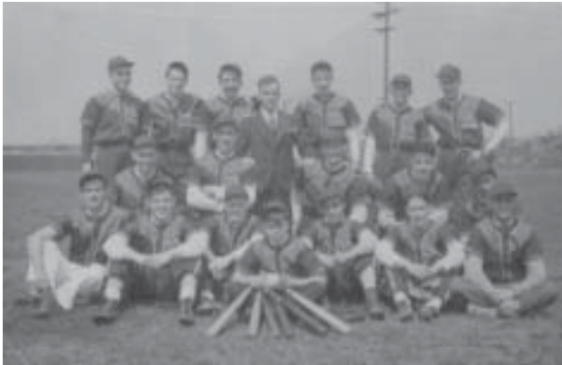
Above: An early photo (1937-38) of a softball team made up of Marktown residents. (i.e. mill employees or family members)

Dating back to the early 1920's there has been baseball played in the Marktown Park, and I don't mean just sandlot ball. When Marktown was first built society was much different. They didn't have many movie theaters and television didn't come about for another thirty years. Companies like Mark Manufacturing and later, Youngstown Sheet and Tube Company sponsored teams in various sports in what was know as City Leagues and Company Leagues. Baseball was one of the seasonal leagues as were basketball and bowling.