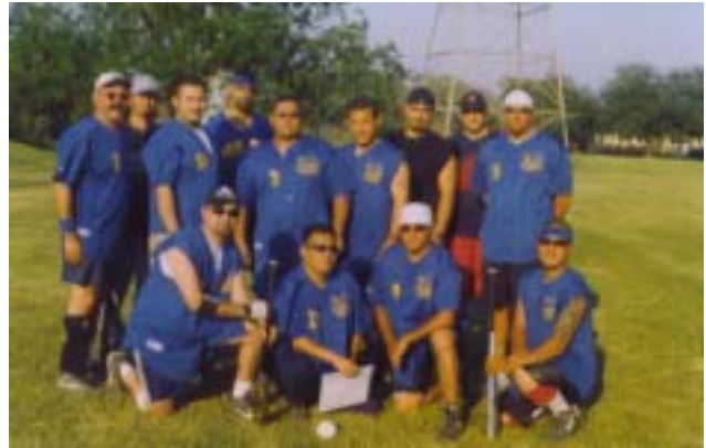
Above: The new East Chicago City Softball League now plays in Marktown several days a week. A Men & Women's League will begin soon!

About two years ago the City of East Chicago stepped forward and began a total evaluation of all twenty East Chicago City Parks. Their decision was that each neighborhood deserves a park and that each park needs to be restored, renovated and improved upon to better meet the needs of our residents. During that process, the